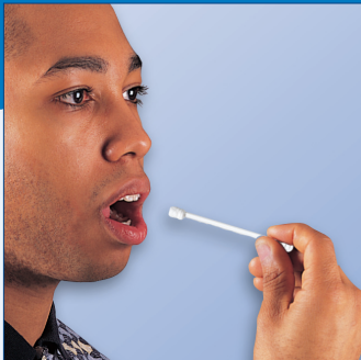
1. Swab mouth to collect saliva.