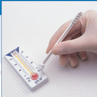
2. Insert collector into test.