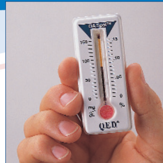
3. Read color bar.